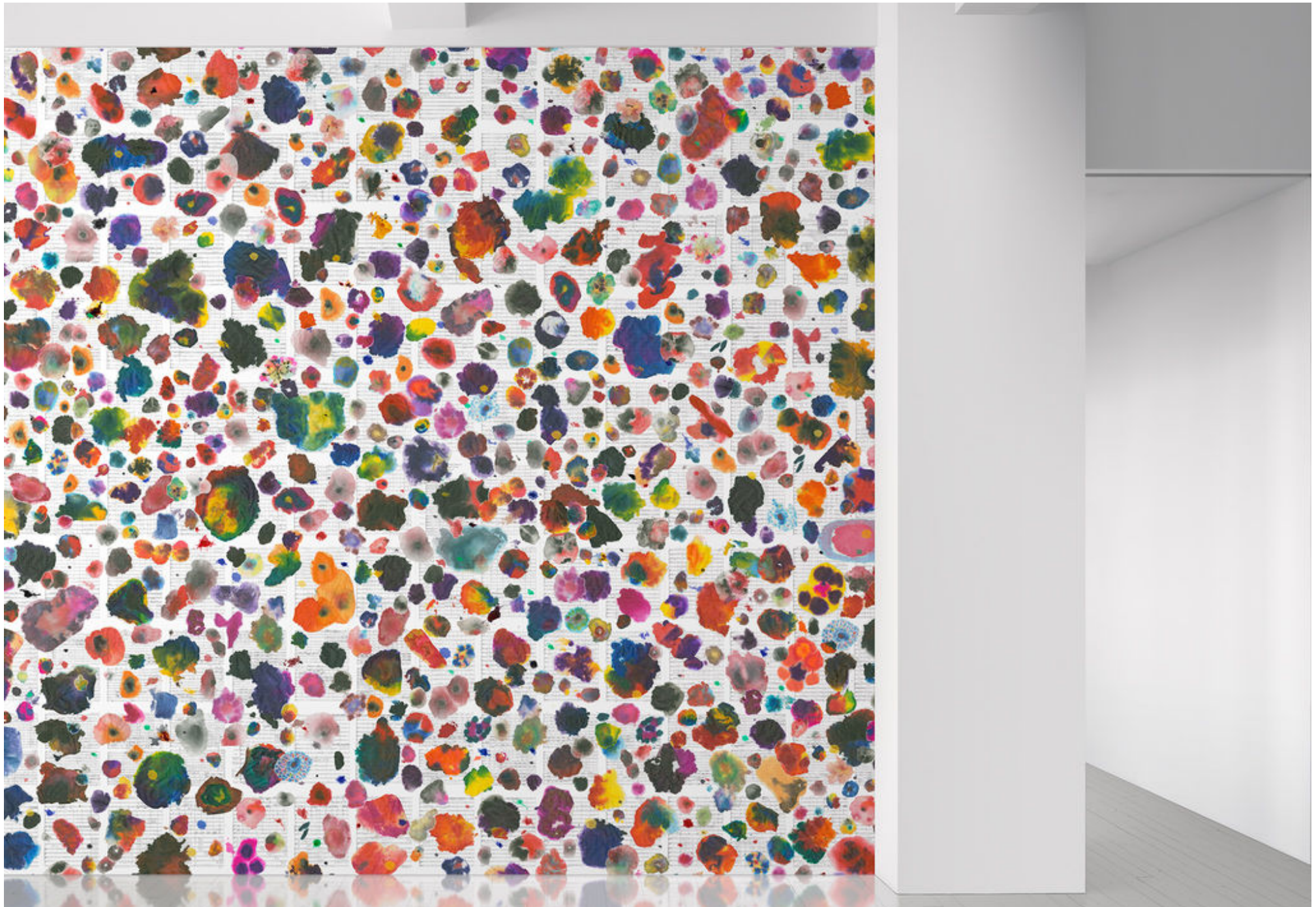
399648 A Midsummer Night's Dream