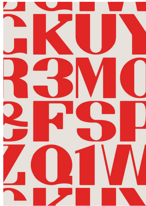
003 Crimson On White