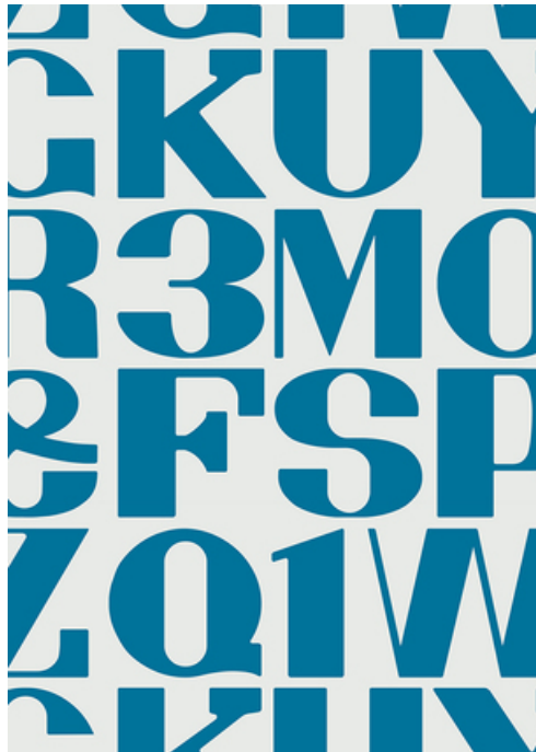
006 Turquoise On White