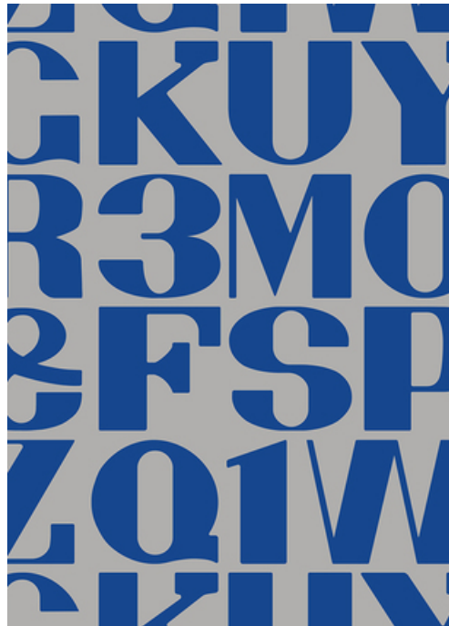
005 Ultramarine On Light Gray