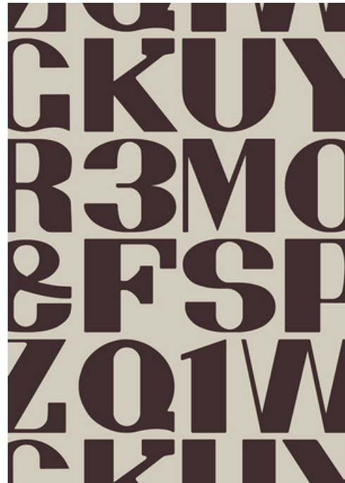
007 Gray Dark On Light Gray