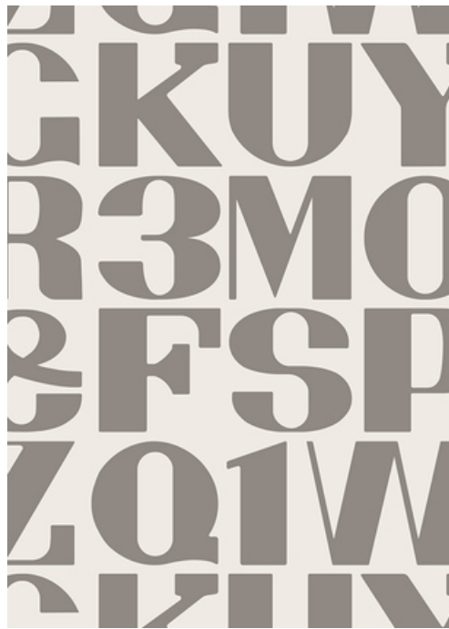
001 Raw Umber On White