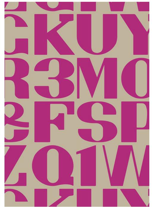
004 Magenta On Light Ochre