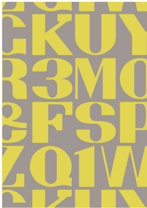
002 Yellow On Light Gray