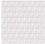
001 Optic White