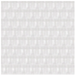
001 Optic White

Complete product information at knolltextiles.com 800.645.3943