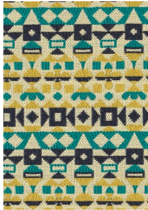
007 Marine and Turquoise

466204 Arabesque by Alexander Girard, 1954