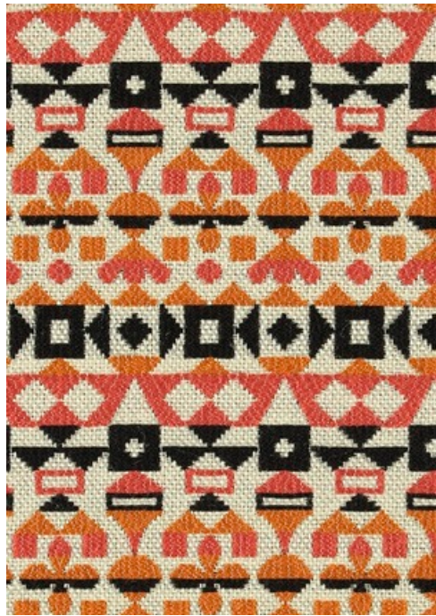
002 Pink and Orange