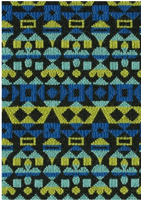
005 Ultramarine and Avocado