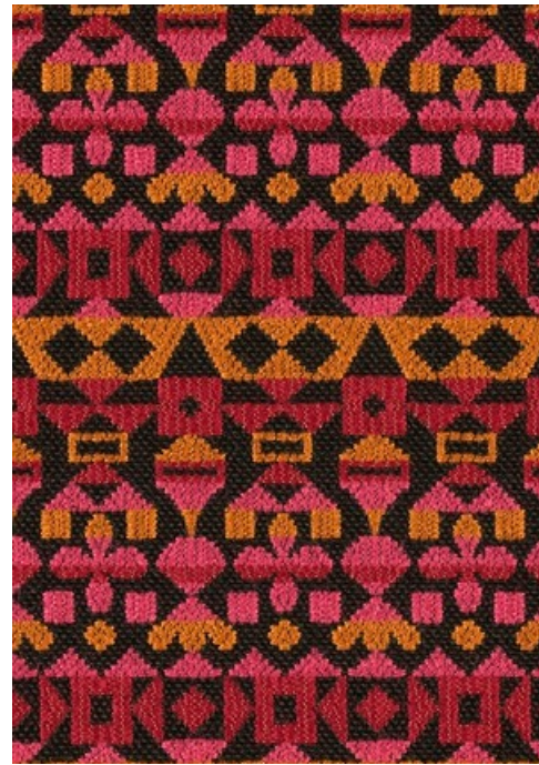
003 Crimson and Pink