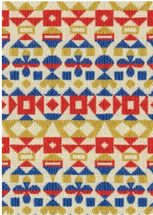
001 Crimson and Ochre