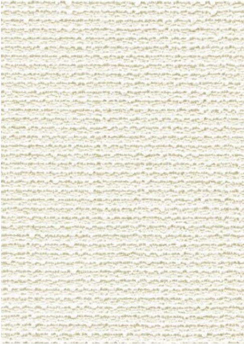
001 White Cap