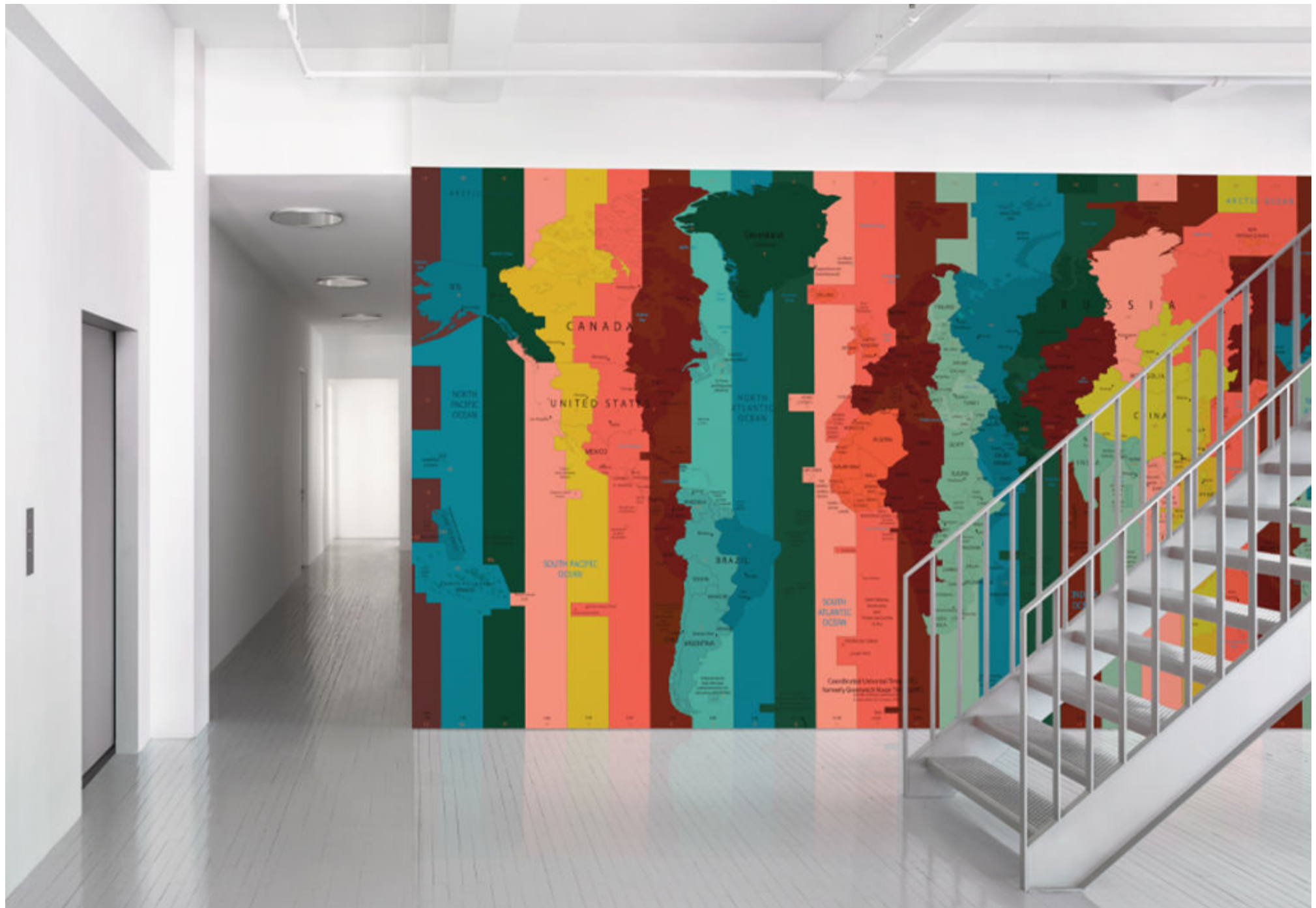
399988 Artist Stripe World Time Zone