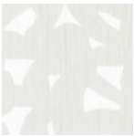
001 Ice Breaker

Complete product information at knolltextiles.com 800.645.3943