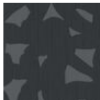
010 Ink Wash