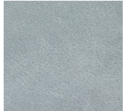
026 Cloud Cover