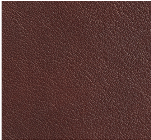
002 Old Chaps