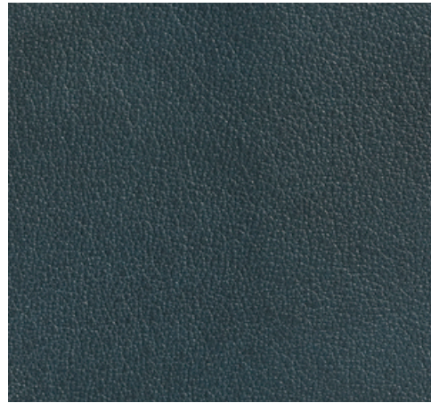
004 So Blue