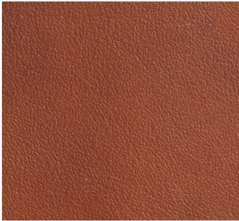
001 Santa Fe