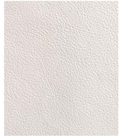
025 Super White