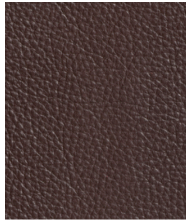
005 Deep Brown