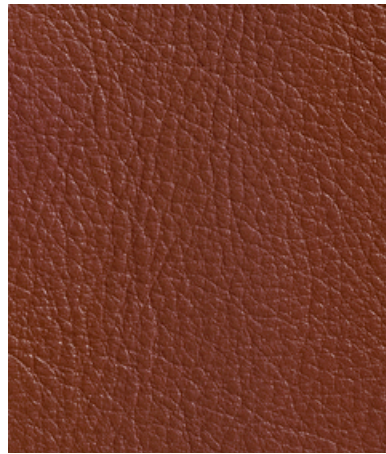
004 Burnt Sugar