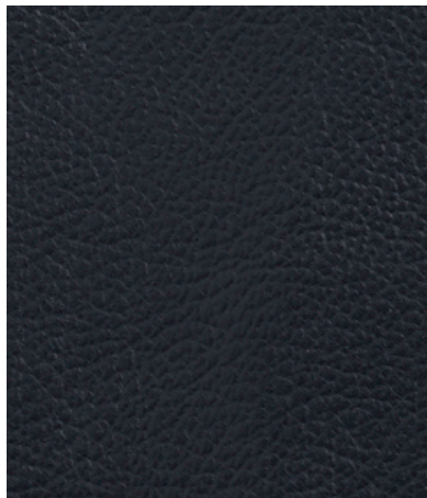
026 Navy Blue