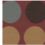
011 Sienna and Madder