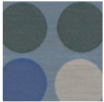
008 Ecru and Royal