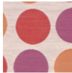
003 Red and Purple