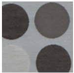
001 Gray and Black