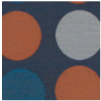
009 Turquoise Dark and Orange