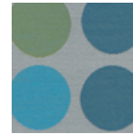
007 Turquoise Light and Green