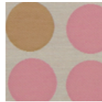
004 Pink and Yellow