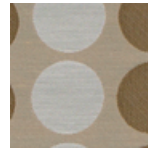
005 Emerald and Ochre