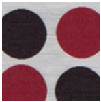
002 Crimson and Ultramarine