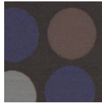
010 Violet and Sepia