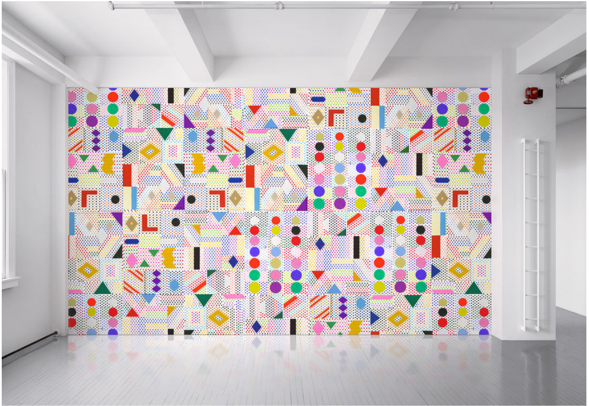
399959 Color Sound Shape Overlay