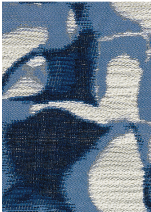
005 Ink Wash