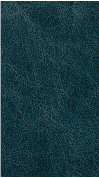
001 Blue Stone