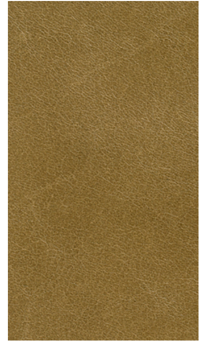
011 Perfect Tan