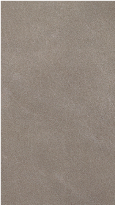
006 Sandy Bank