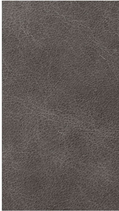
007 Old Sterling