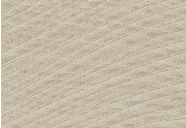
002 Sound Wave