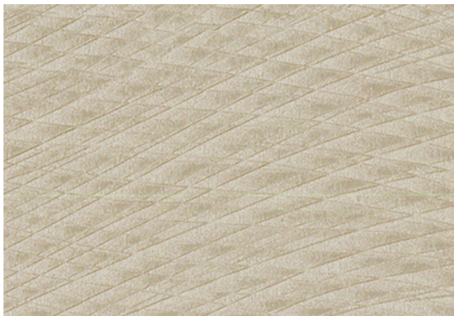
002 Sound Wave