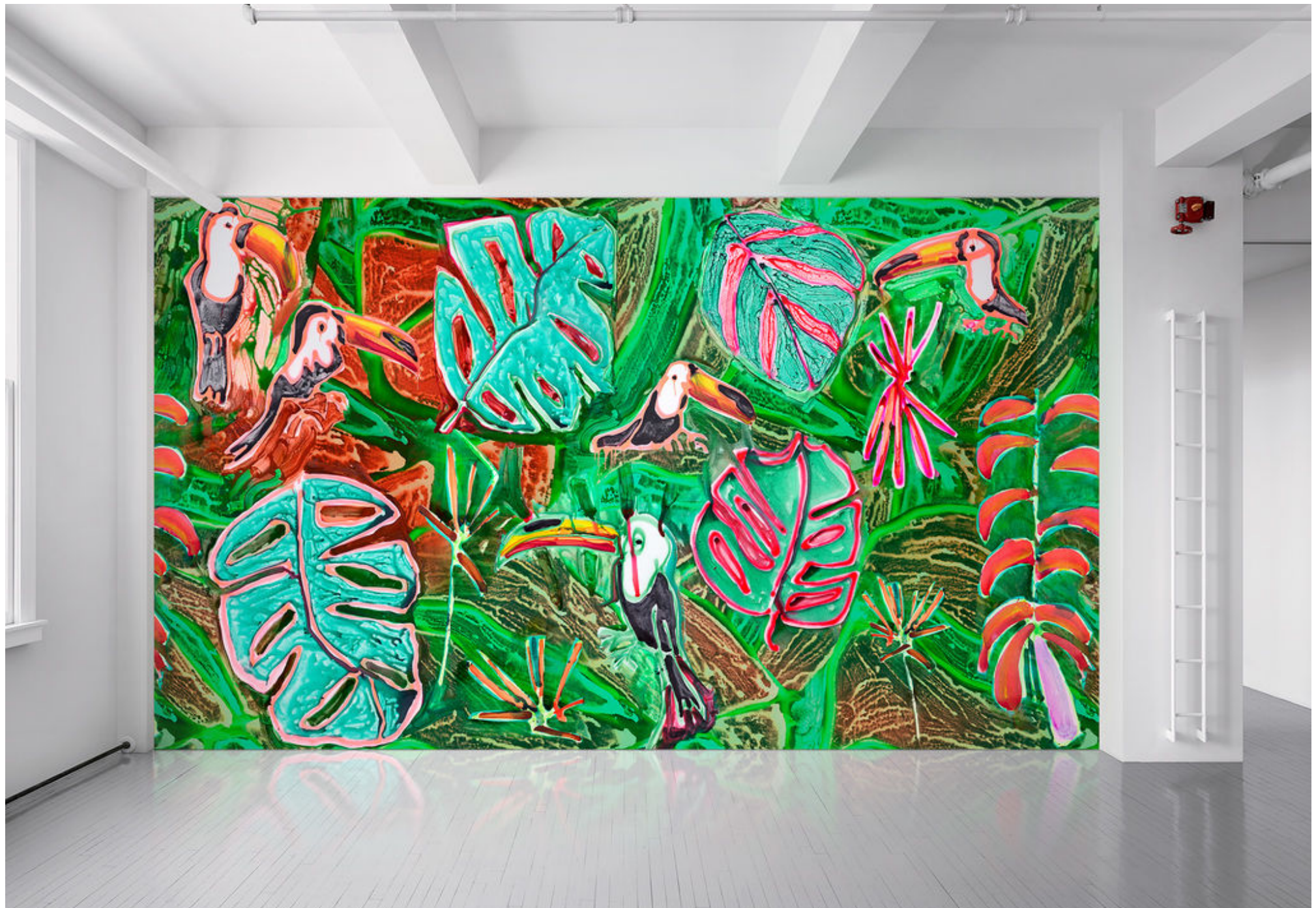
300005 Emerald Jungle