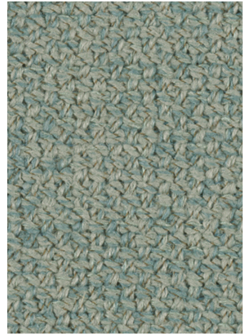
004 Liberty Harbor