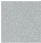
006 Blue Lake