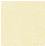
002 Warm Gray