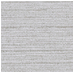
003 Wax Transfer