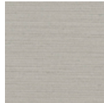
020 Plaster Board