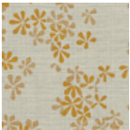
001 Lemon Drop

Complete product information at knolltextiles.com 800.645.3943