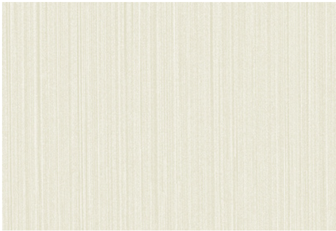
001 Cloud Mist