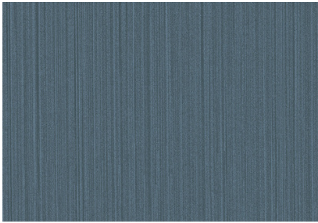
008 Ocean Bed