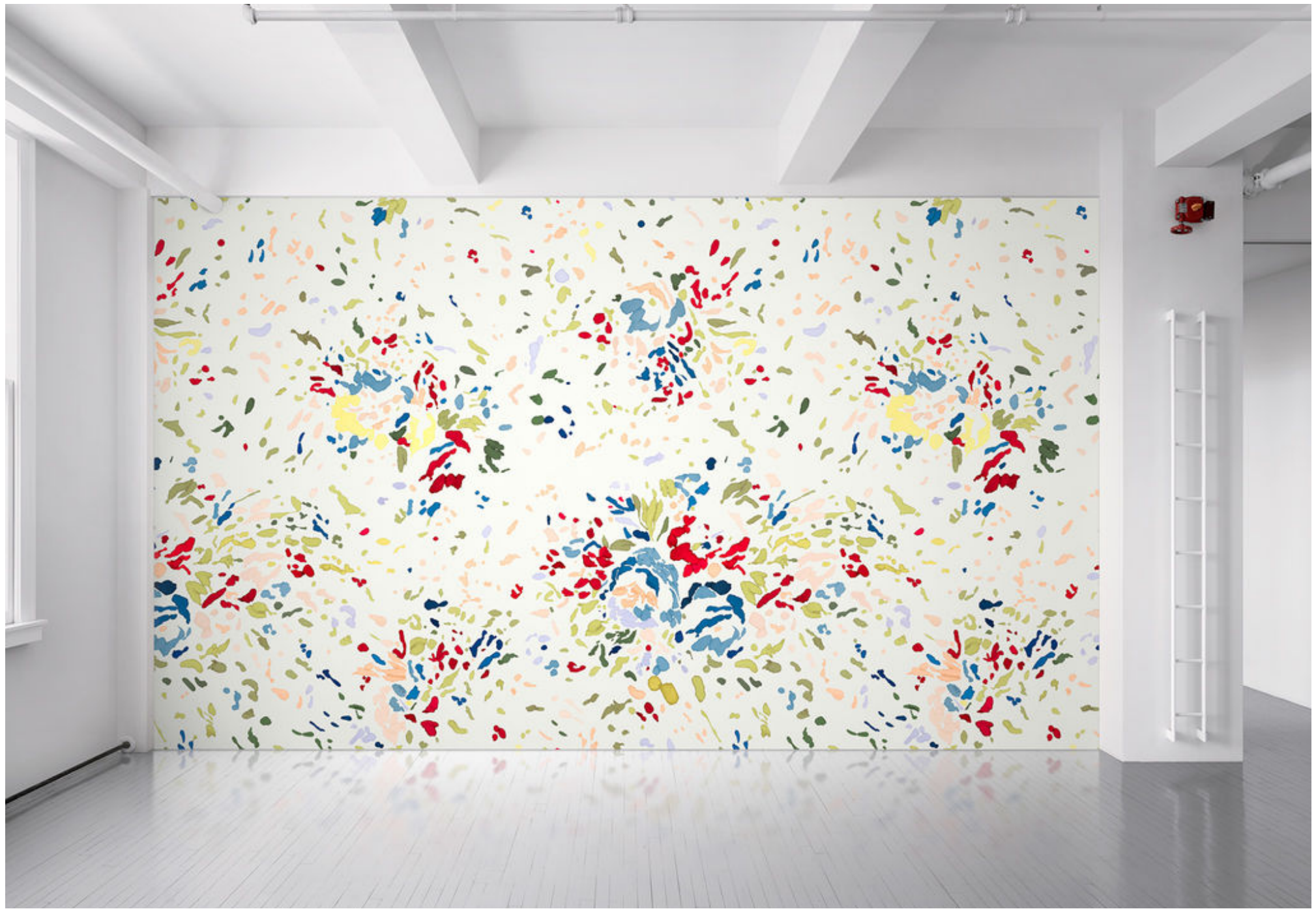
399596 Inky Flower