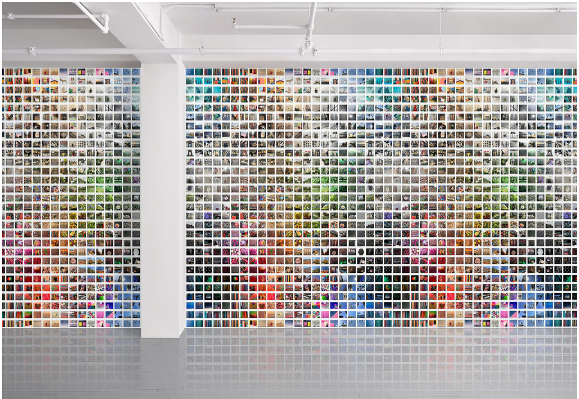
300060 Instant Photo