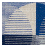
005 High Tide