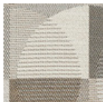
001 Sandy Shore