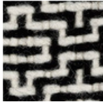
004 Black White