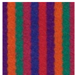
001 Multicolored Bright

Complete product information at maharam.com 800.645.3943