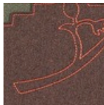
002 Earth/ Chocolate/Coral