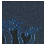
003 Black/Navy/ Cobalt