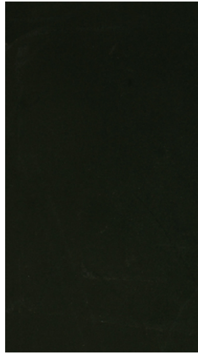
005 Dark Green