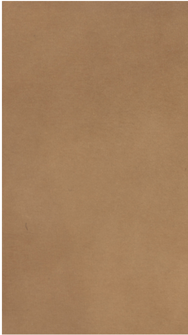
013 Very Natural