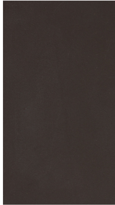
031 Grey Slate