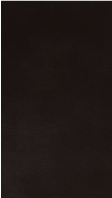
012 Pitch Brown