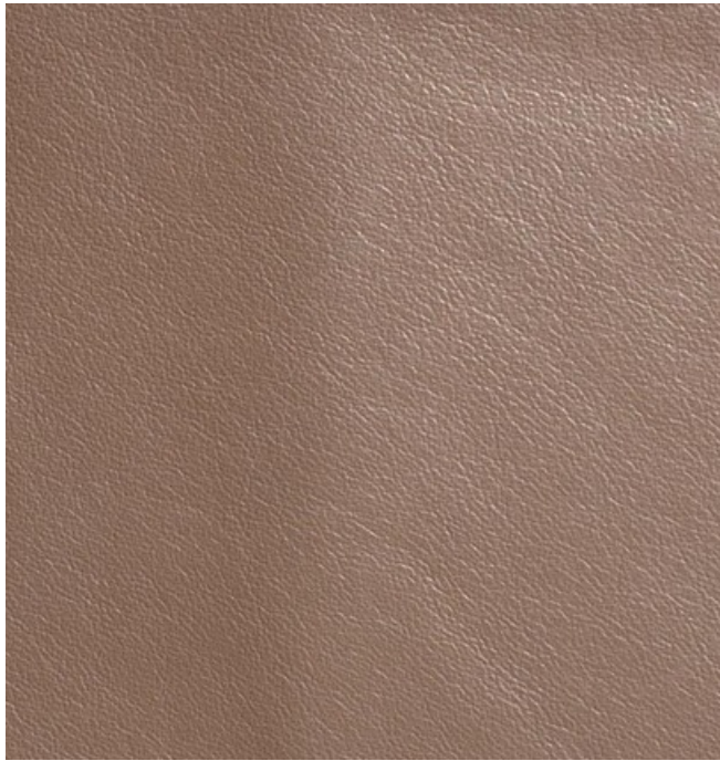
005 Pearl Taupe