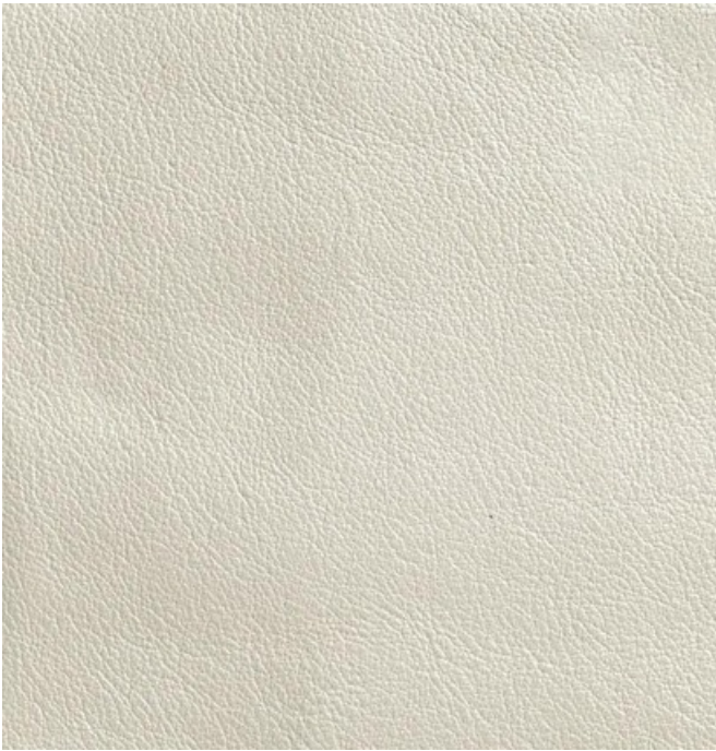
004 Mother of Pearl