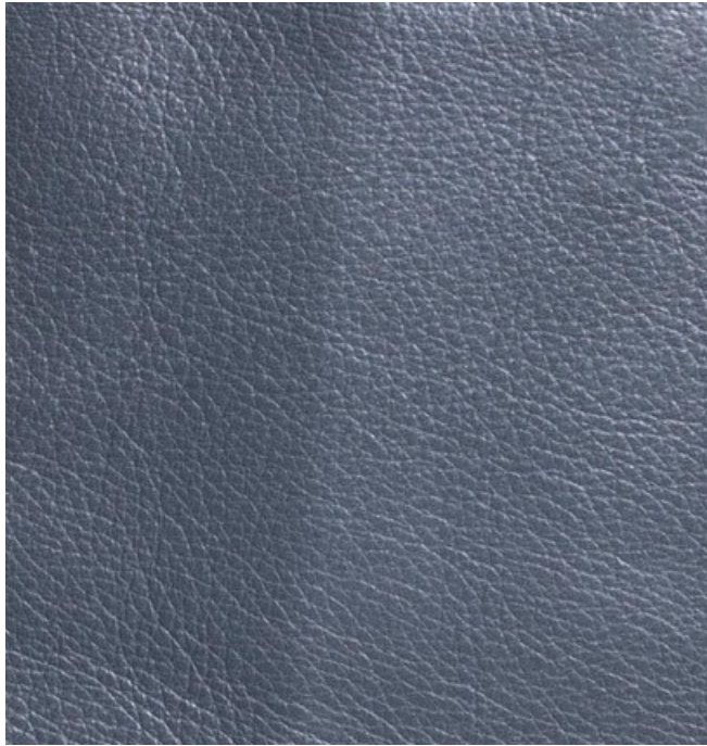
010 Steel Blue