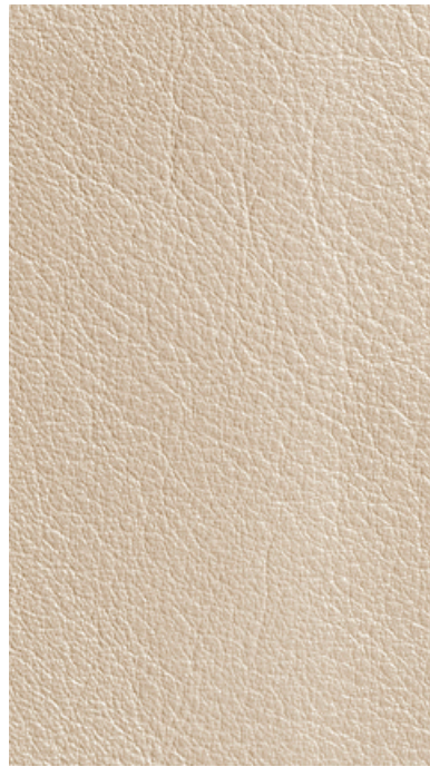
006 Milky Way