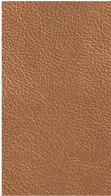
003 Indian Summer