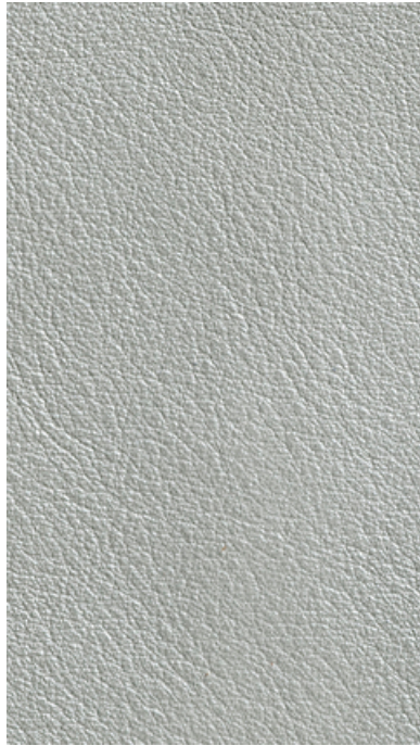
014 Winter Sky