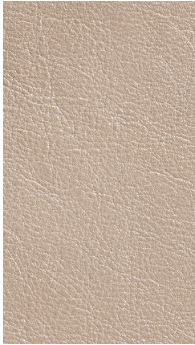
012 Snow Beam