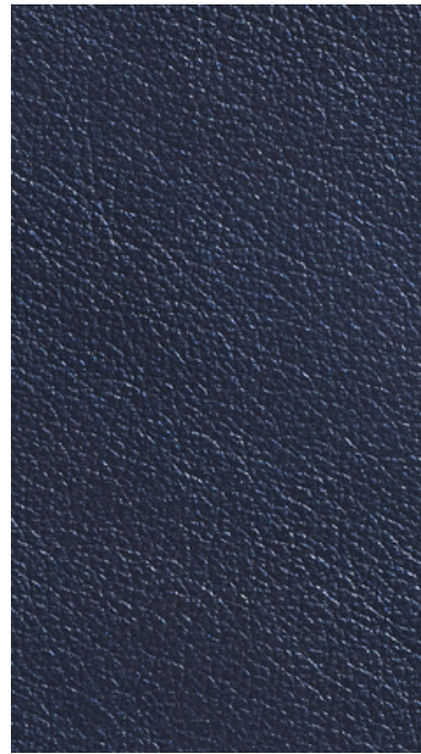
009 North Star