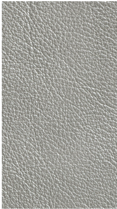
004 Silver Lining