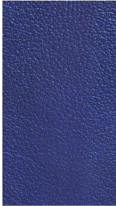
015 Cobalt Blue