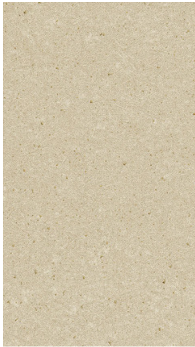
002 Desert Sand