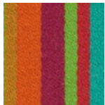
001 Multicolored Bright