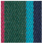
005 Viridian and Violet