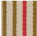
001 Dark Ochre and Black

Complete product information at maharam.com 800.645.3943