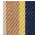
004 Madder and Navy