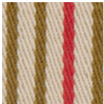
001 Dark Ochre and Black