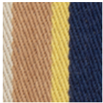
004 Madder and Navy