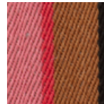
003 Ultramarine and Pink