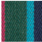
005 Viridian and Violet