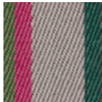
002 Emerald and Sienna