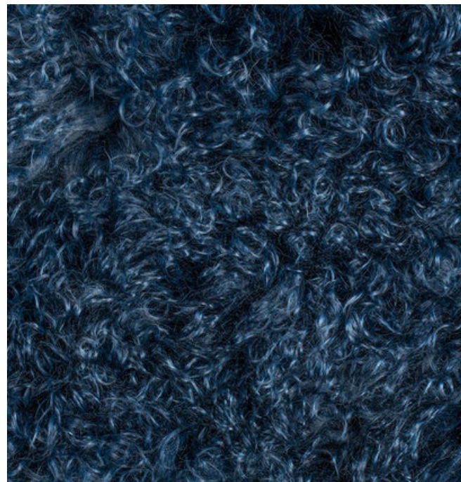
003 Blue Jeans