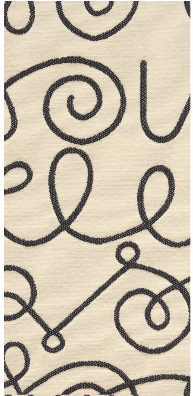
003 Black On White