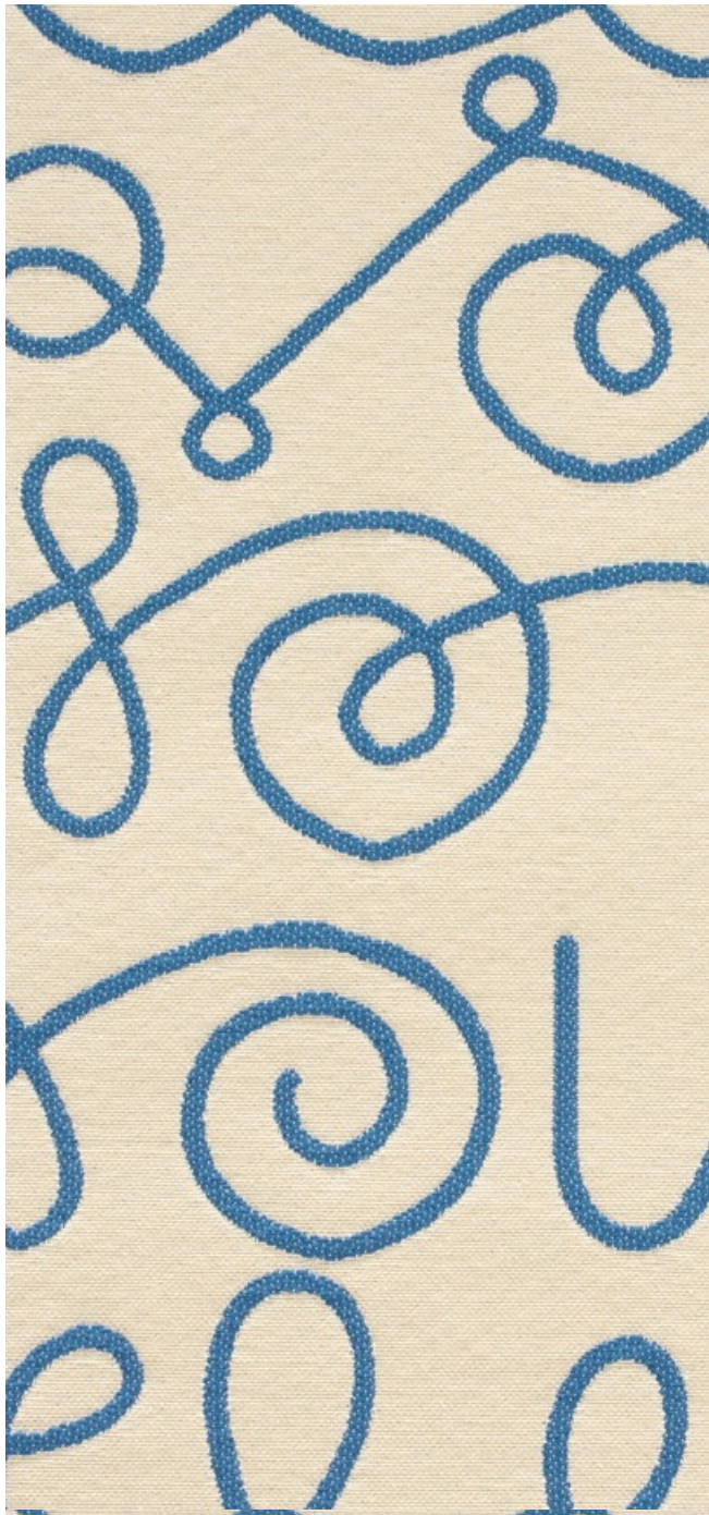
002 Ultramarine On White