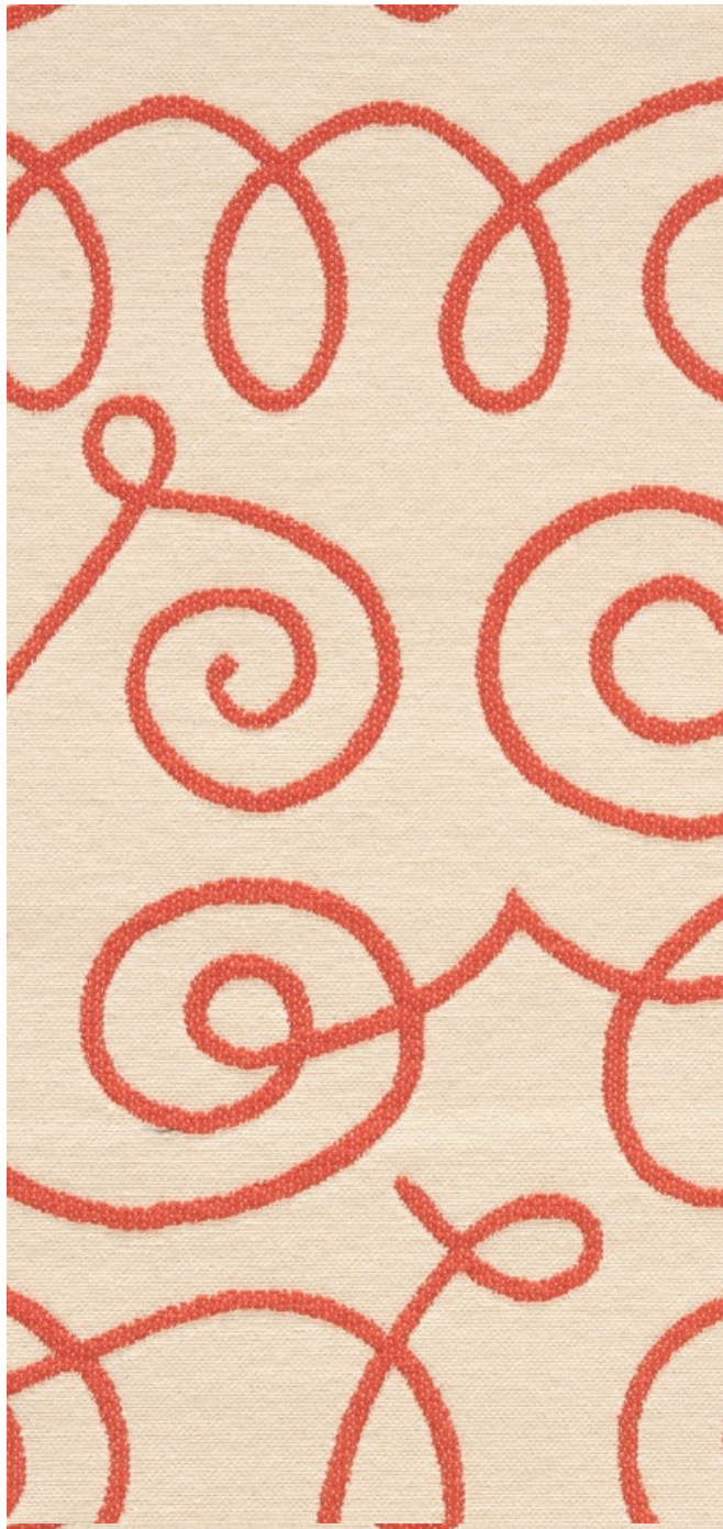
001 Crimson On White