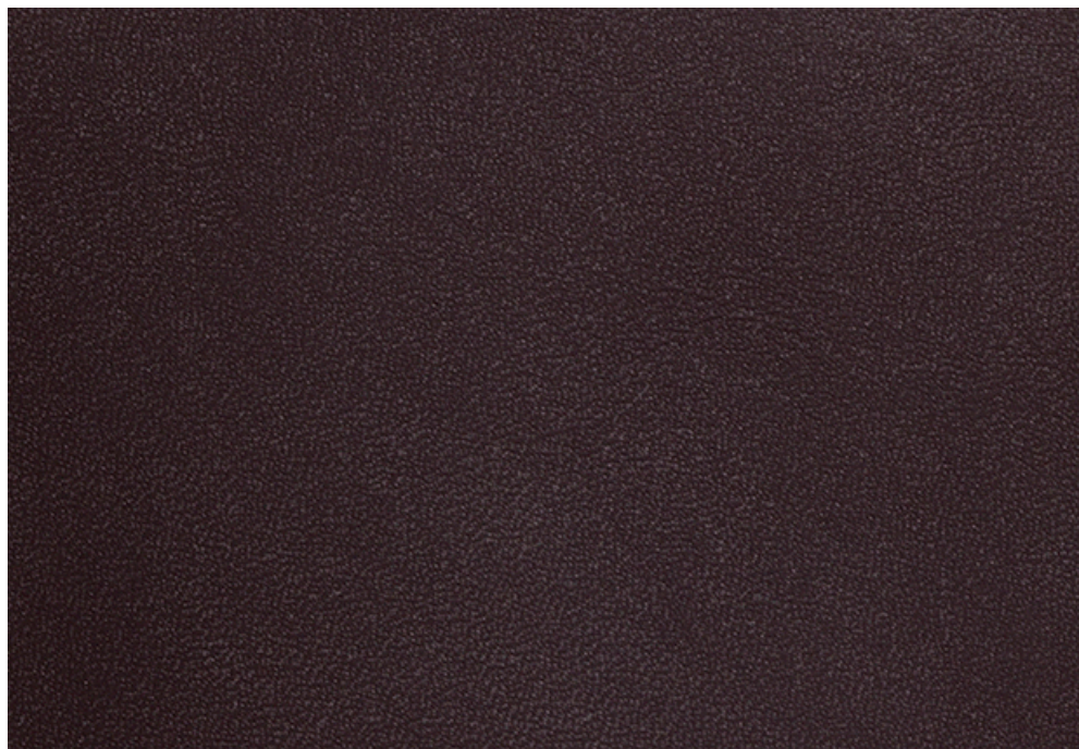
017 Pitch Brown