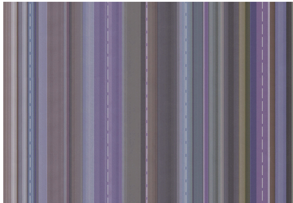
006 Night Sky