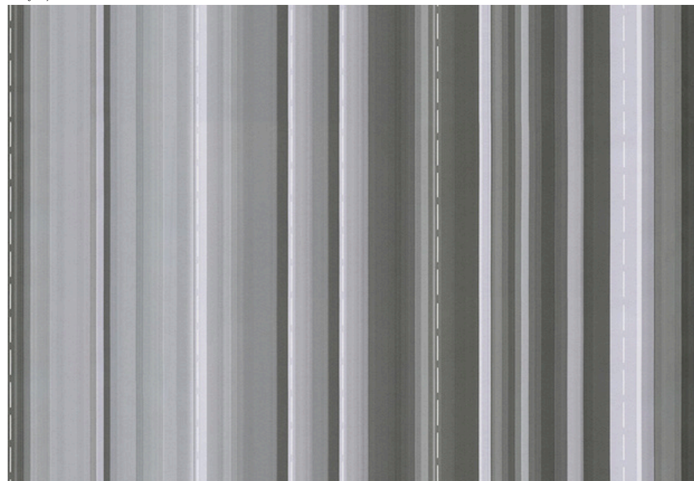
008 Time Zone