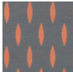
010 Orange and Dark Gray