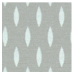
001 Ultramarine Light and Gray