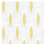
003 White and Ochre