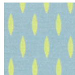
005 Yellow and Dark Gray