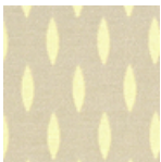
002 Taupe and Yellow Light