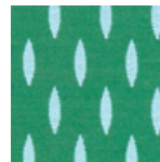
006 Ultramarine and Emerald