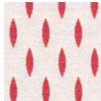
011 Crimson and White