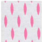
008 Pink Dark and Gray