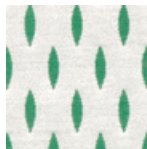
004 White and Emerald