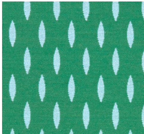
006 Ultramarine and Emerald