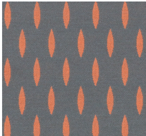
010 Orange and Dark Gray