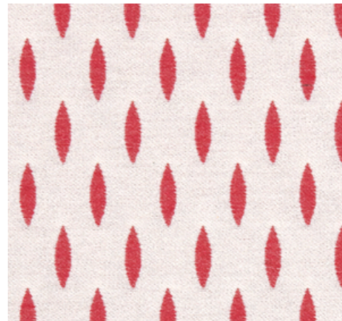
011 Crimson and White

466576 Pepitas by Alexander Girard, 1952