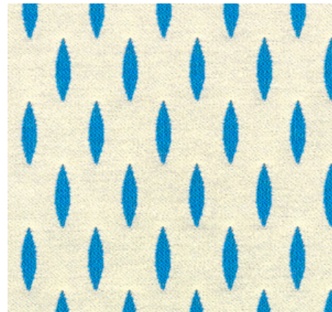
007 Turquoise and Taupe