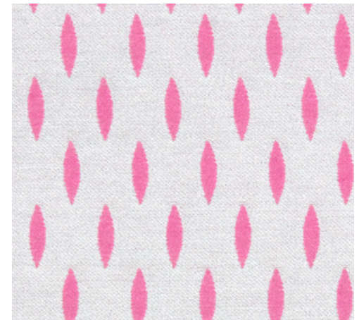
008 Pink Dark and Gray