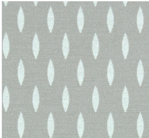
001 Ultramarine Light and Gray