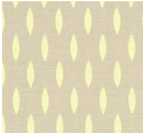
002 Taupe and Yellow Light