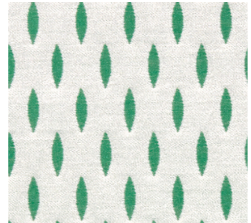
004 White and Emerald