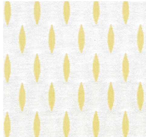
003 White and Ochre