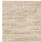
007 Bleached Pine