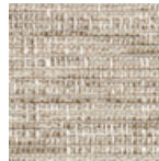
006 Dry Plain