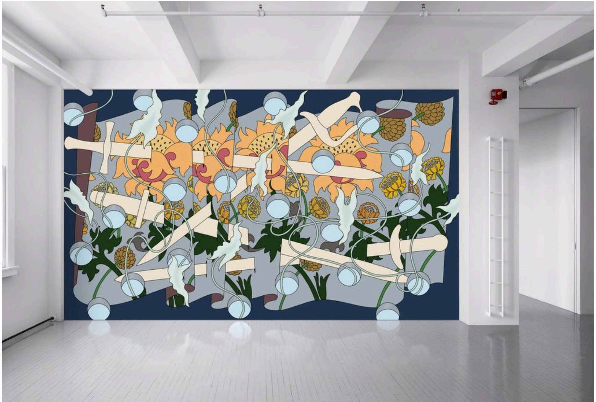
399989 Pierced Banner