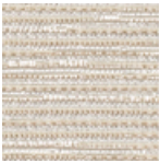
001 Raw Silk

Complete product information at knolltextiles.com 800.645.3943