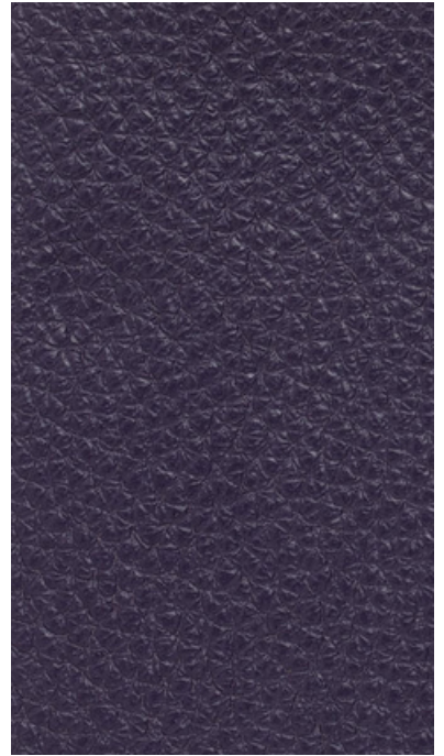
010 Deep Plum