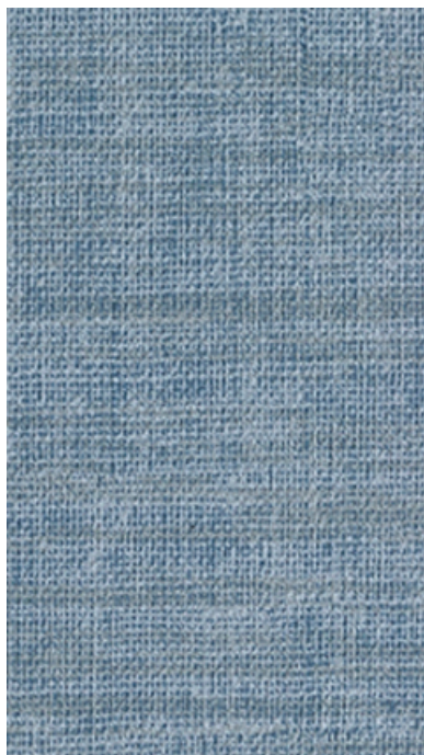
007 Water Drop