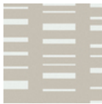
002 White On Light Gray