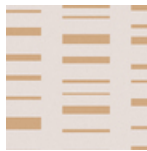
003 Ochre On White