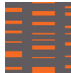
005 Orange On Dark Gray