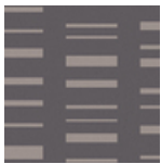
001 Raw Umber On Dark Gray

Complete product information at maharam.com 800.645.3943