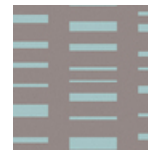
007 Ultramarine White On Raw Umber