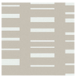
002 White On Light Gray