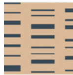
004 Gray On Light Ochre