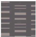
001 Raw Umber On Dark Gray

Complete product information at maharam.com 800.645.3943