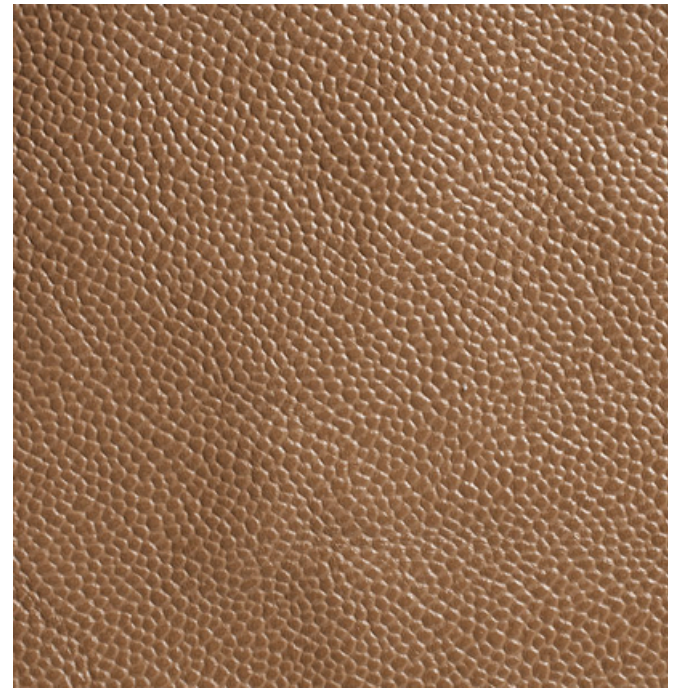
025 River Bed