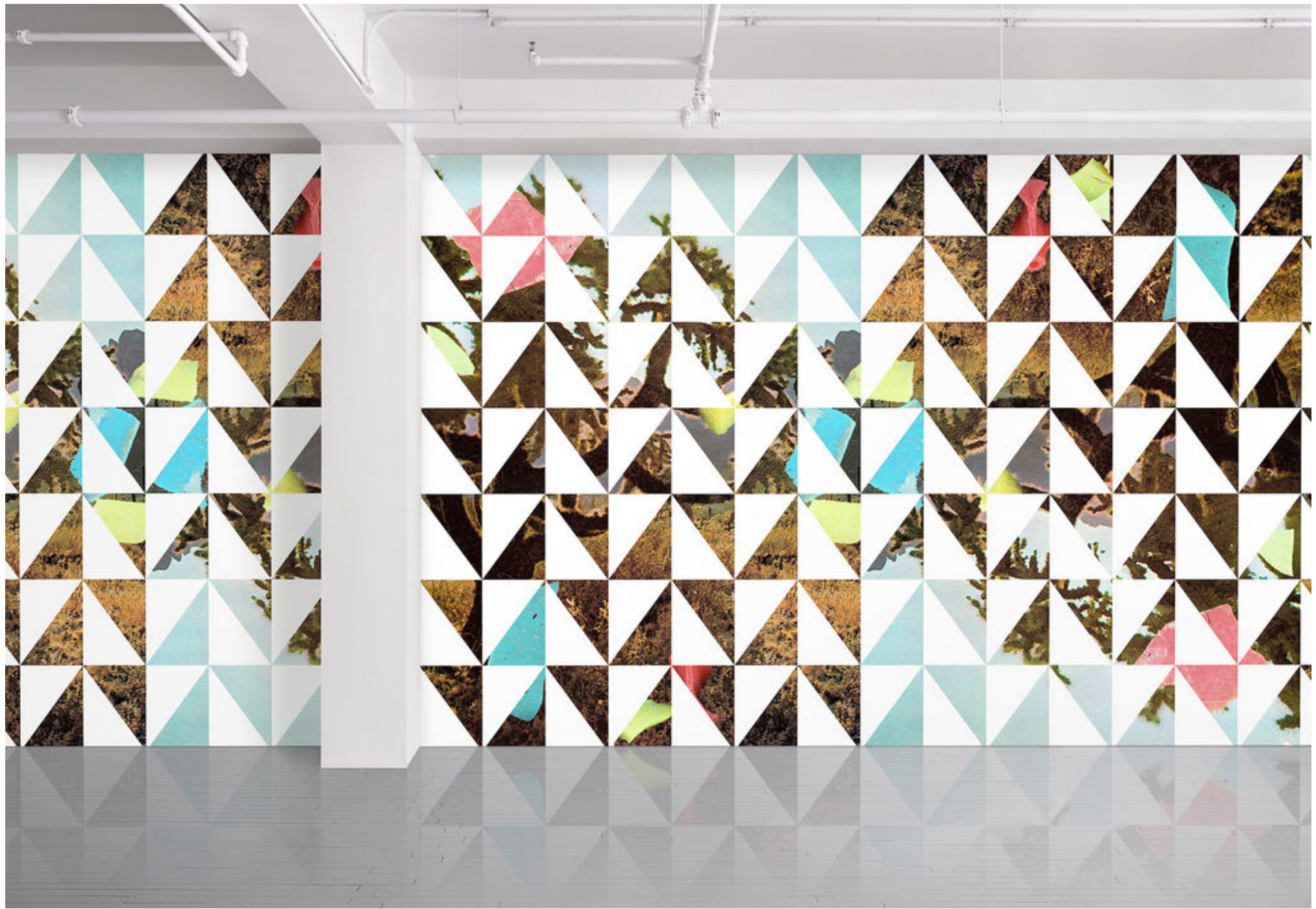
399585 Screen (Double Desert Inverted)