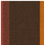
002 Tiger Eye