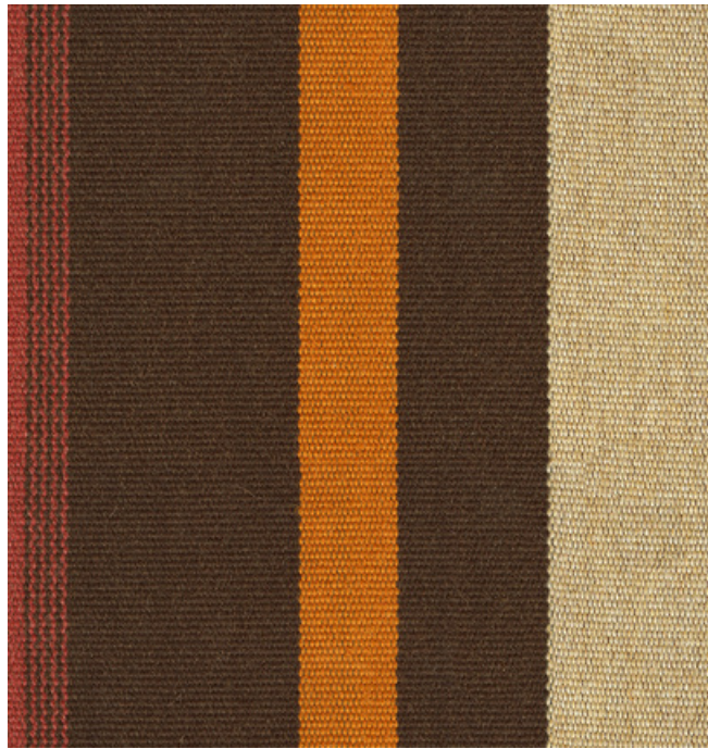
002 Tiger Eye