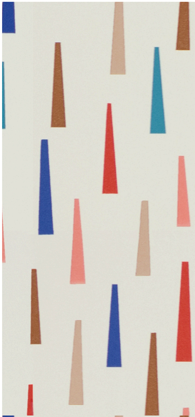
002 Crimson and Ultramarine