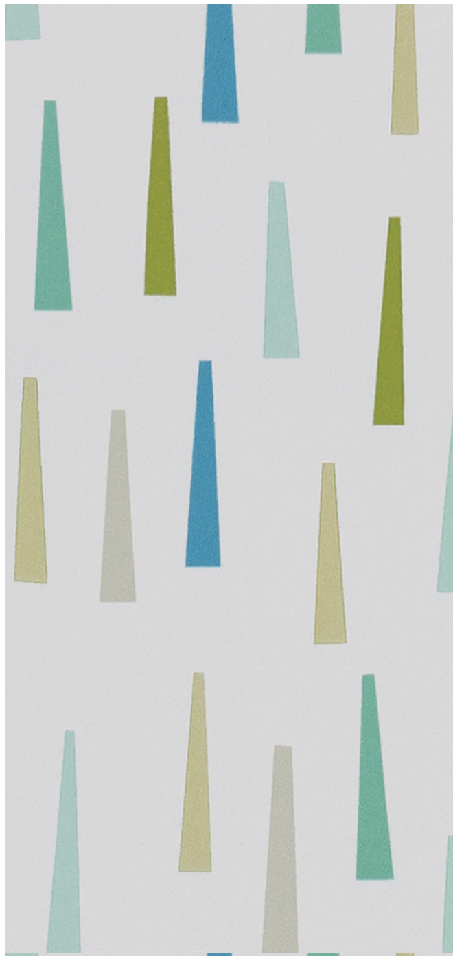
001 Emerald Light and Turquoise