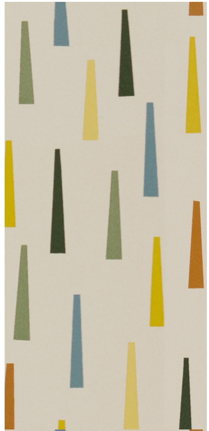
003 Olive and Sienna

399930 Showers by Alexander Girard, 1958