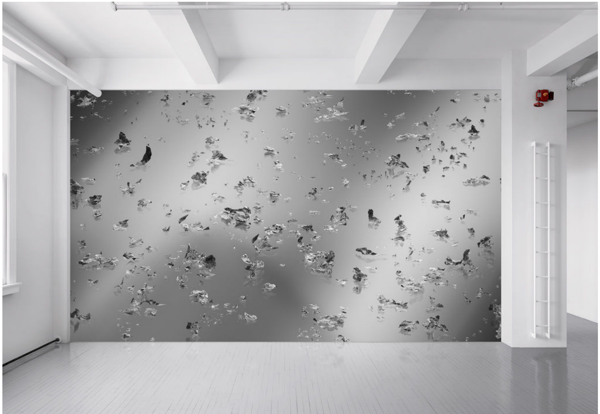
399558 Silver On Mirror (For Ron)